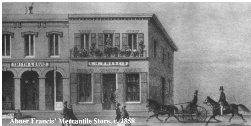
Abner Francis' Mercantile Store, c. 1858

Available: http://www.portlandonline.com/planning/index.cfm?c=39750 .