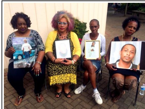
Mothers who have lost their sons to gun- and gang-related violence and are saying, Enough is Enough!

Annual Hope and Healing Activities: This team allows families to engage in healthy activities in a non-judgmental environment with others who have shared experiences. Activities include the 2014 Christmas Memorial Tree, Mother's Day Dinner, and the 1st Anniversary Rose Bush Planting.