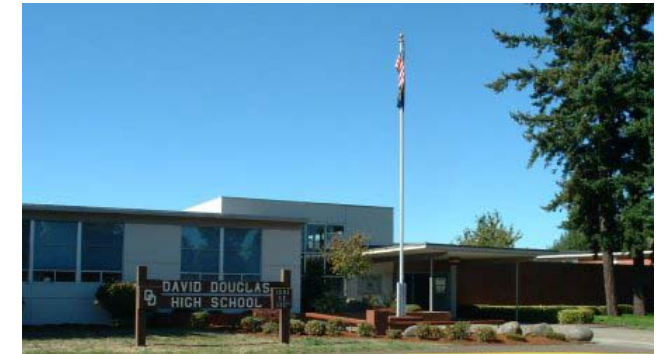
David Douglas High School: Portland's largest and fastest-growing.